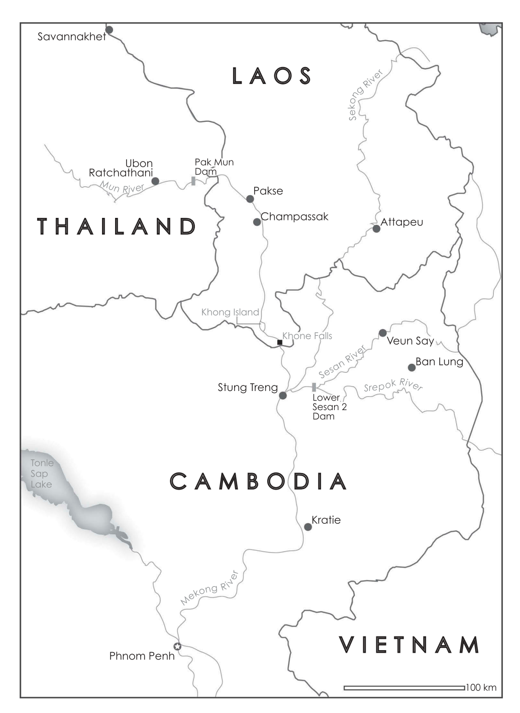
Figure 1. The study area (northeastern Thailand, southern Laos and northeastern Cambodia).

ecologists have also increasingly embraced relationality (Forsyth 2003; Robbins 2004), so these two perspectives are now more compatible, but political ecology contributes more with regard to political economy and uneven power relations.