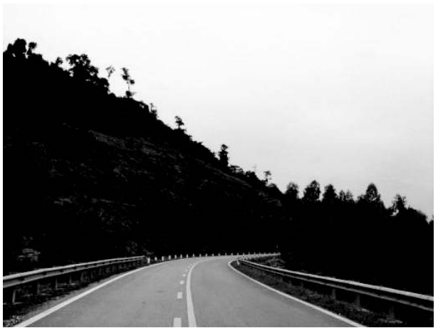
Route No. 12A (AH131) shortcut in Ky Anh District