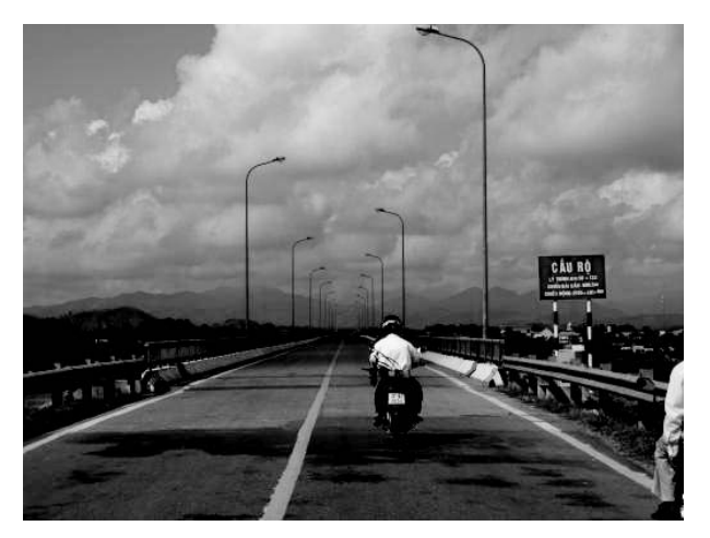
The Ro Bridge on Route No. 46A crosses the Lam River.

Nam Can International Border Gate in Ky Son, Nghe An, connects Xiengkhuang Province with the ocean via Route No. 7, which was constructed by the French during the colonial period. This corridor plays a crucial role for the foreign trade of several provinces in north Lao PDR. Due to Laos' steep Phou Bia mountain range, with elevations sometimes exceeding 1,500 m, Route No. 13 north from Vientiane to Luang Prabang is very tough for drivers. Therefore, the import and export cargos of Luang Prabang and Xiengkhuang provinces are not conveyed along north-south Route No. 13 but along west-east Route No. 7. The corridor is also an important connection between hinterland northwest Nghe An and the active economy of southeast Nghe An in Vietnam.