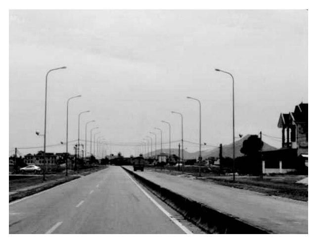
Route No. 12A (AH131) is a shortcut in Ky Anh Town.