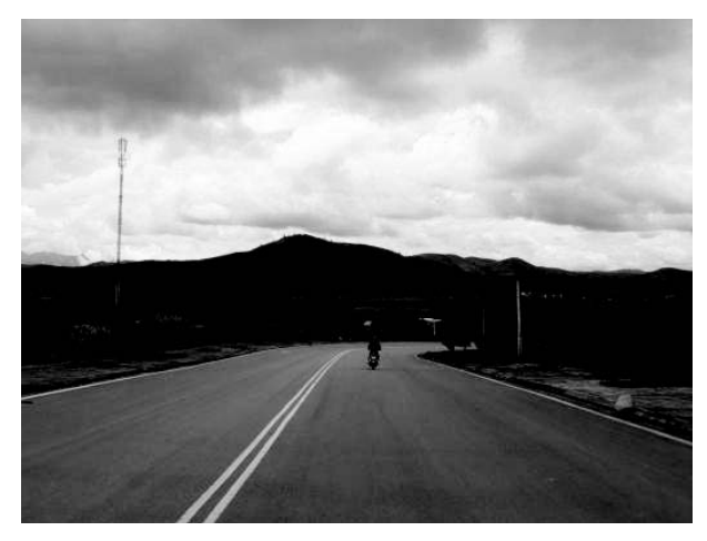
Route No. 40 as seen in Ngoc Hoi, Kon Tum. flooding from