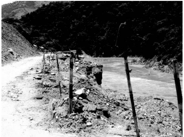
Route No. 7A in Ky Son suffered erosion by the flash flood at Nam Mo River in July 2011. Source : Taken by the author on July 26, 2011.

A Lao van on Route No. 7A in Tuong Duong. The road here is about 5 m wide. Source : Taken by the author on July 26, 2011.