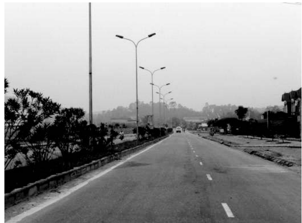
Route No. 8A near Duc Tho Town. This section is a dual two-lane road with median strip.

International Border Gate in Huong Son of Ha Tinh. The part in Vietnam utilizes Route No. 8A, Route No. 1A and Cua Lo Port (for vessels under 10,000 DWT) or Vung Ang Port (for larger vessels). This corridor is named as AH15 in the Asian Highway network. Route No. 8A, at 94 km, runs from east to west in the north of Ha Tinh Province, and crosses Huong Son and Duc Tho districts and Hong Linh Township. Urban areas along Route No. 8A include the towns of Tay Son, Pho Chau and Duc Tho, and Hong Linh Township. In Pho Chau (Huong Son District), Route No. 8A overlaps with Ho Chi Minh Highway for several km. At Truong Son (Duc Tho), Route No. 8A meets Route No. 15. At Hong Linh, Route No. 8A meets Route No. 1A.