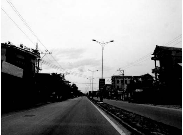
Route No. 12A (AH131) as seen in Ba Don Town.