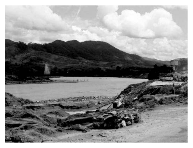
This erosion along Ho Chi Minh Highway (Route No. 14) in Dak Glei was caused by the Poko River.