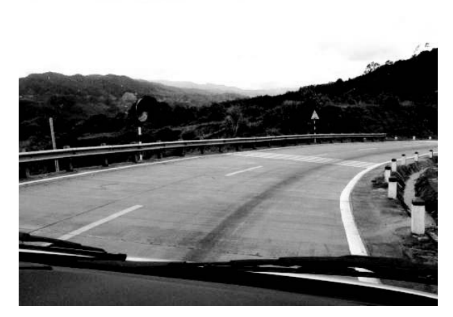
Ho Chi Minh Highway as seen at the Lo Xo Pass, Dak Glei, Kon Tum.

Source : Taken by the author on 18 September 2011.