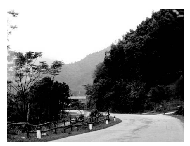
Route No. 8A at the foot of the Keo Nua Pass in Son Kim 1Commune, 20 km from the border. The road surface here is a stone chip-tar asphalt mix.