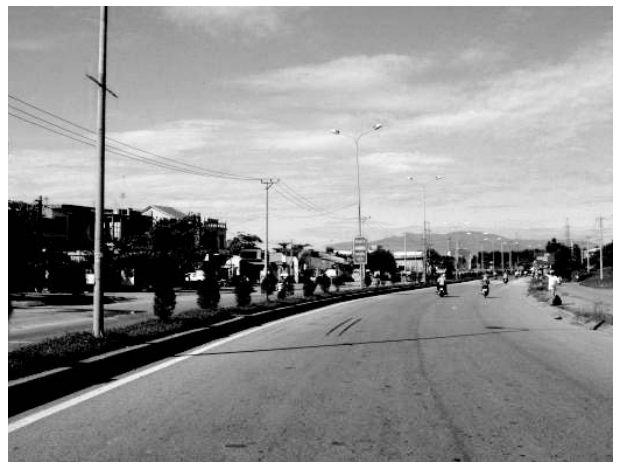
Route No. 14B as seen at a Danang surburb.

often threatened by landslides and erosion during the rainy season (from May to October).