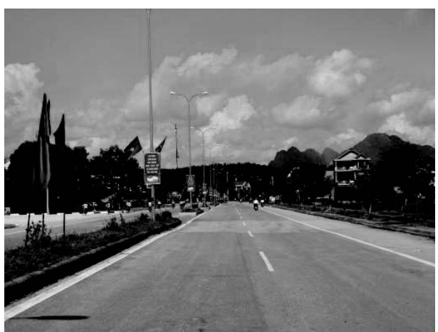
Route No. 7A in Anh Son Town has two lanes each way with a median strip.