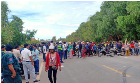
Garment workers protest, blocking national road 51 in Kandal Province.

Click here to get Khmer Times Breaking News direct into your Telegram