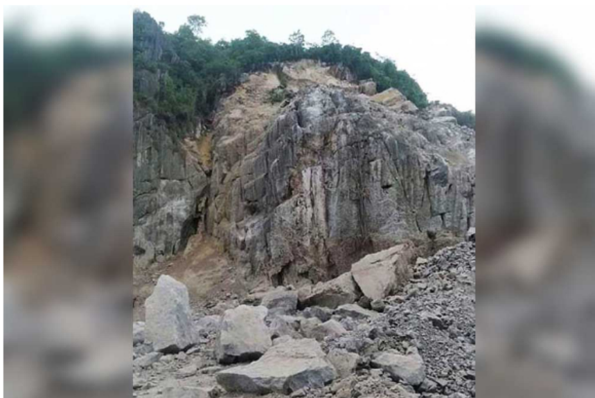
The workers were crushed at a quarry by falling rocks while drilling at an explosion site.