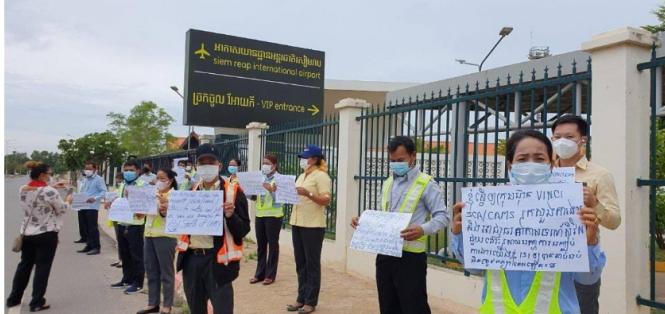
Former Siem Reap airport staff protested in front of the airport to demand compensation on July 23.