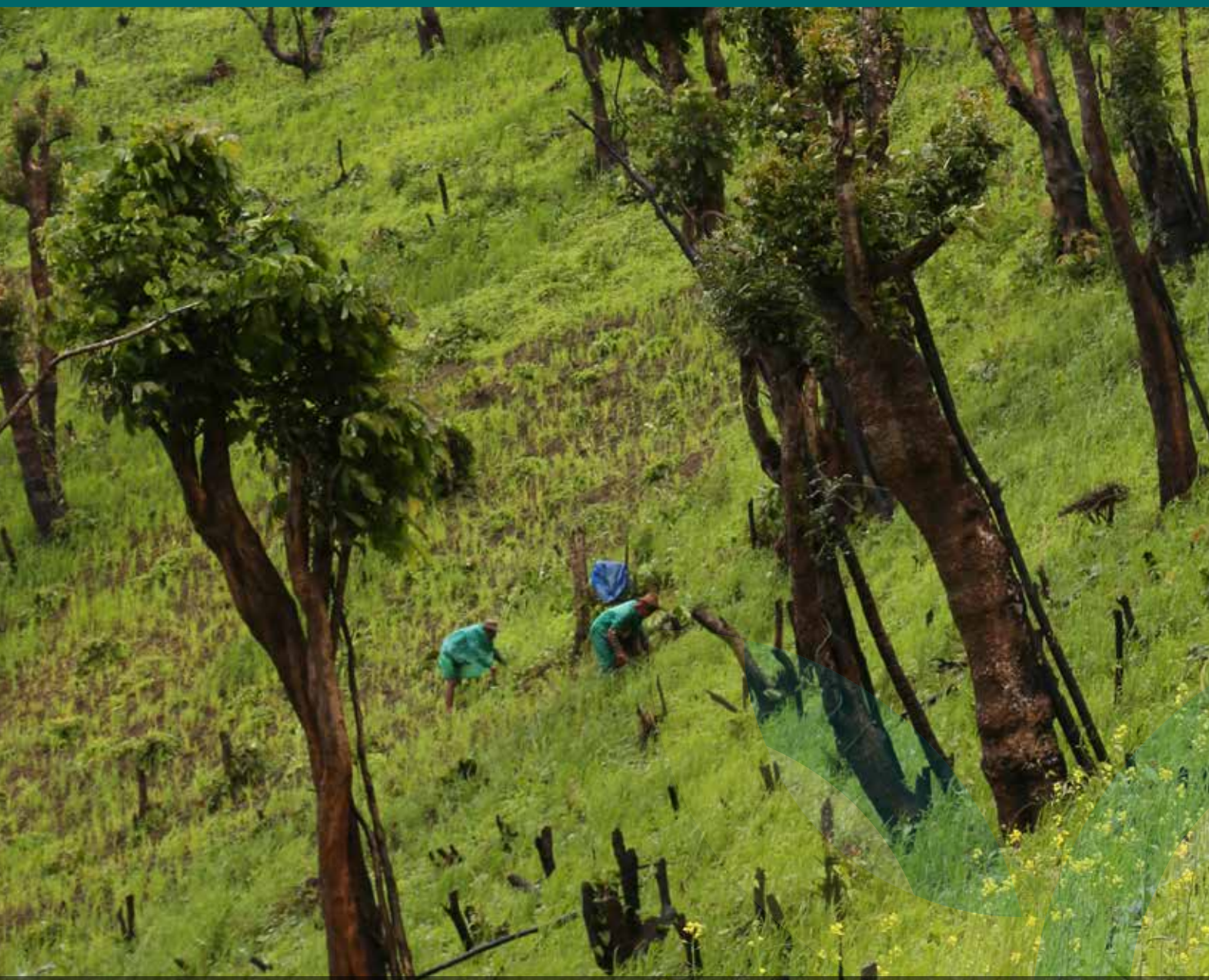
Shifting cultivation field in the Kurpra Community in Kayah State, on land that is owned by both clans and individuals.