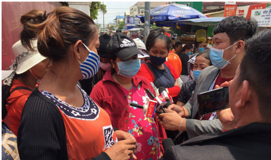
Workers at Hulu Garment factory protest after they accused the company of firing them.