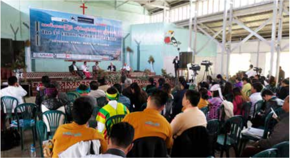
Burma News International gathers ethnic media outlets at an annual conference to discuss the challenges in reporting in a minority language.