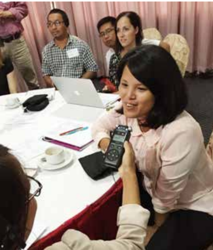
Community radio might soon be introduced in Myanmar, and for this reason several trainings have been held.

towards mainstreaming gender and diversity.