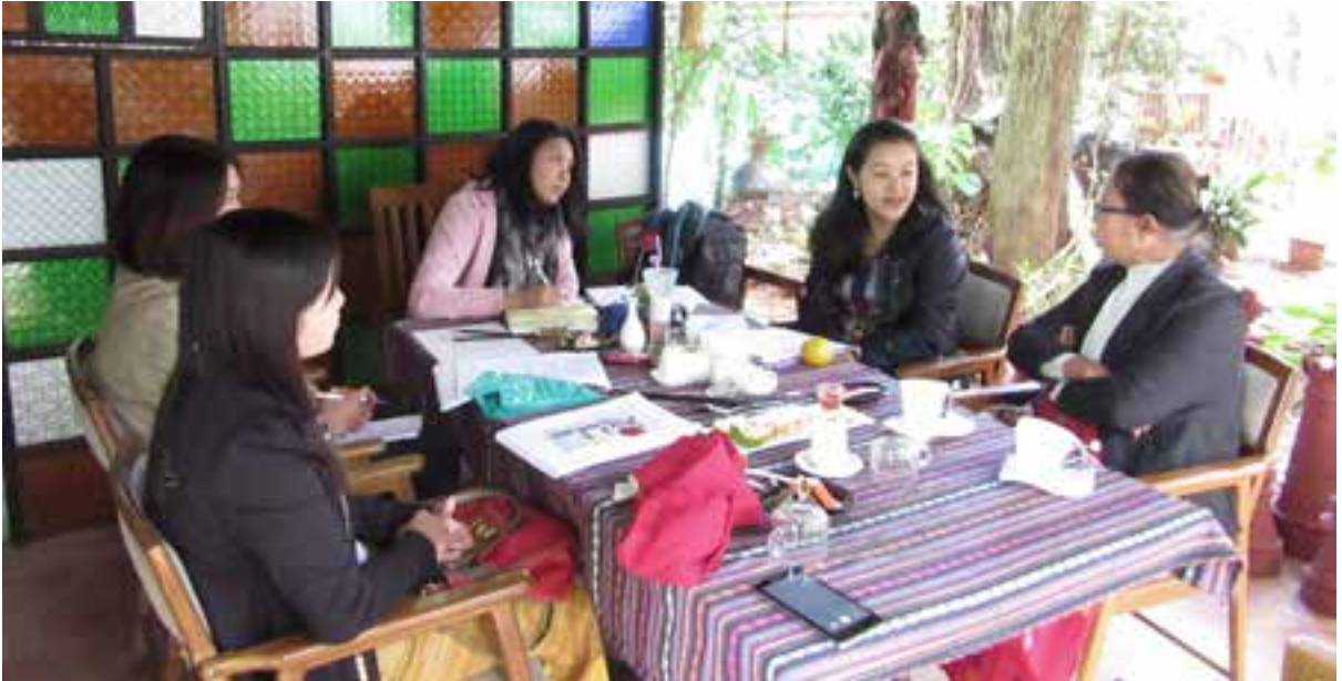
A women-only focus group discussion.

even reserves some positions for men only; further limiting the participation of women in political life. As a result of the November 2015 elections, 13% of the newly elected Members of Parliament are women, up from 4.6%. When the seats reserved for the military are included in the equation, this means that just 9.7% of the total number of seats will be filled by women. 3