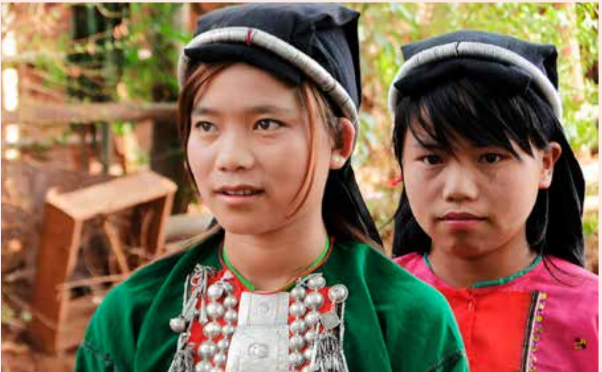
Karen girls in Shan state.