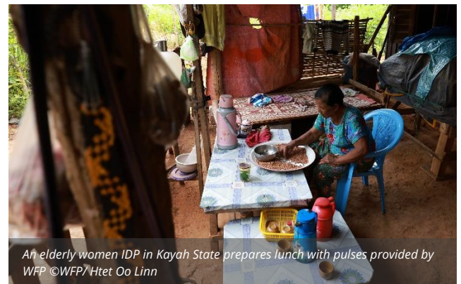
An elderly women IDP in Kayah State prepares lunch with pulses provided by WFP

A group of children attending a nutrition and hygiene awareness session conducted by WFP in Maungdaw Township, Rakhine State.